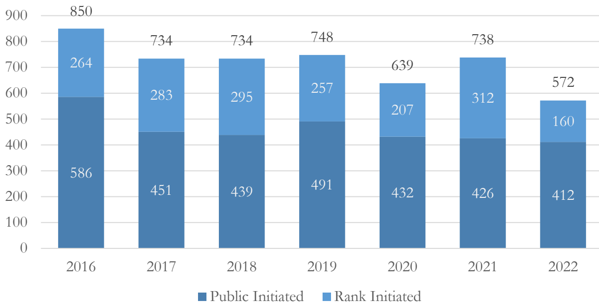
Figure 1: Total Complaints by Source 2016-2022

Between 2016 and 2022 the portion of complaints that were initiated by a member of the public fluctuated from 58-72% and the portion of complaints that were initiated by members of NOPD fluctuated from 28-42 percent.