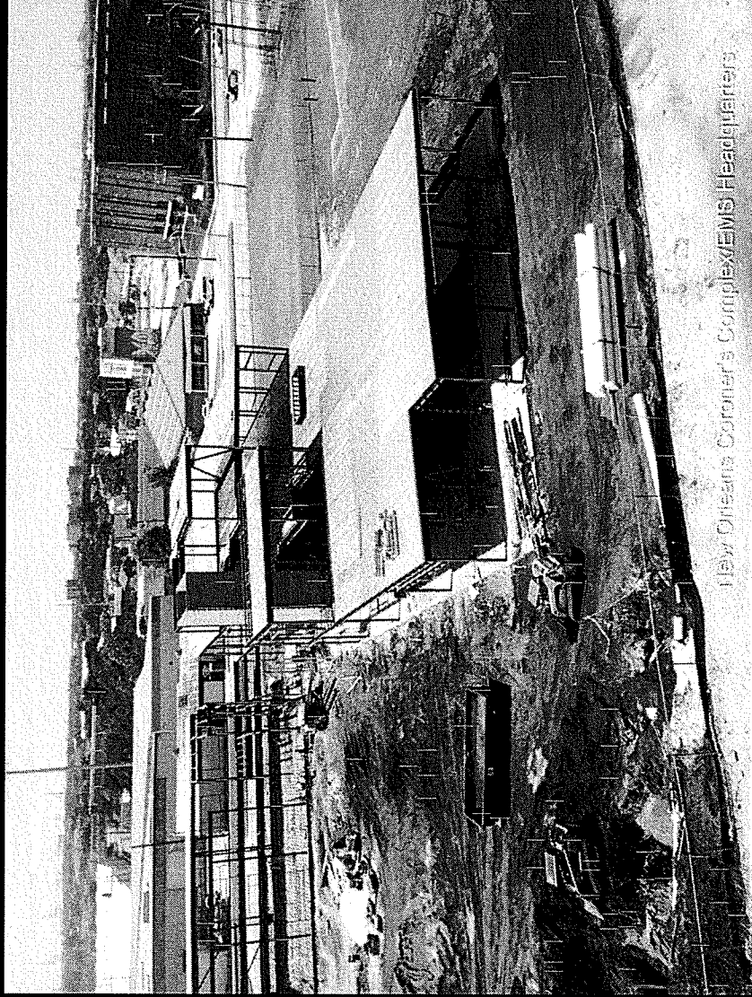
New Orleans Coroner's Complex/EMS Headquarters