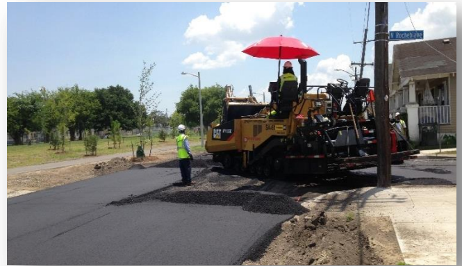
An Incidental Road Repair may include asphalt patching work; repairs to damaged curbs, sidewalks and driveway aprons; and installation of American with Disabilities Act-compliant curb ramps at intersections.

Scientific data is used to determine whether an Incidental Road Repair is needed. In some instances, the condition of your roadway was found to be in such poor condition that the only way to correct the roadway would be to completely remove the existing asphalt, replace the base material and re-pave the roadway. Justification for an Incidental Road Repair varies; however, what you can expect during construction is similar across the City.