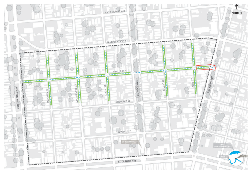
St. Roch project area showing the blocks targeted for improvement.

The Saint Roch neighborhood project area consists of the 26 city block section bounded by N. Roberston St. to the north, Franklin Ave. to the east, St. Claude Ave. to the south and Elysian Fields Ave. to the West. The neighborhood experiences chronic flooding from even relatively small storms, with more severe flooding associated with larger storm events. The flooding has damaged numerous homes and businesses within the neighborhood and ponded water on streets often necessitates the rerouting of traffic. The storm drain system is undersized and approximately half of the streets within the project area have little or no existing drainage infra-