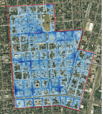
Many of the narrow historic streets in St. Roch are pavement from stoop to stoop.